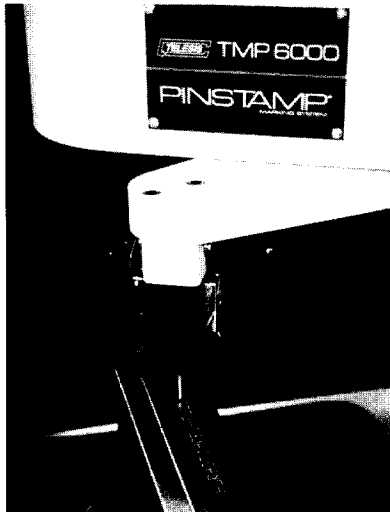
LEFT: TMP6000 inside the sound-deadening enclosure.

TMP6000 Single-Pin Marking System for the driver-side and passenger-side air bag