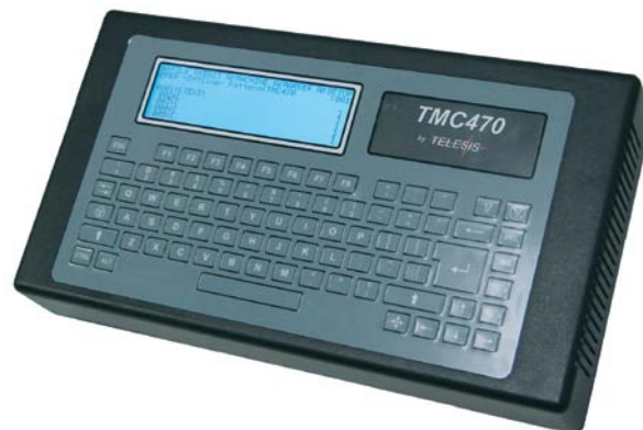
TMC470 Marker Controller

Each of the EAS marking systems include the stand alone TMC470 controller which features two serial ports, a USB port for pattern file back-up and one Ethernet port for connectivity.