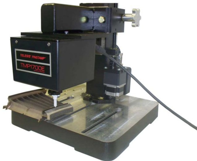
PINSTAMP® TMP1700/470EAS Marker

Circleville, OH – November 10, 2012-- Telesis Technologies Inc., a world leader in manufacturing standard and customized permanent marking and engraving equipment, presents the ELECTRIC AUTOSENSE, EAS Series of electromechanical pin markers developed specifically for 2-D code applications. This series of products include three marking systems: the TMP1700/470EAS , TMP3200/470EAS , and the TMP6100/470EAS . These dual stepper motor driven single pin markers are immediately available for commercial sale.