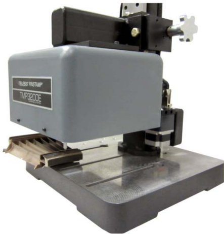
PINSTAMP® TMP3200/470EAS Marker