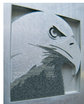
Engraved approximately 4mm deep in aluminum