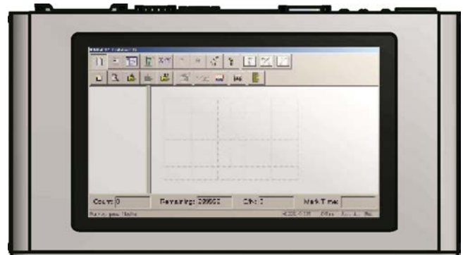
TMC600 Controller with Touch Screen Monitor and MerlinTouch PS Software

The top panel of the controller contains an integrated, 10-in., high resolution, touch screen monitor. The monitor displays the MerlinTouch PS software and provides the user interface for operating the marking system.