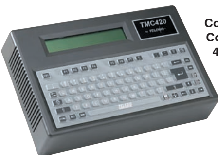
Compact TMC420 Controller features 4-line LCD Display — no PC required.