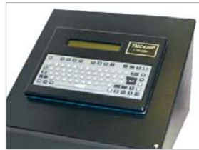
TMC420N Nema Enclosure